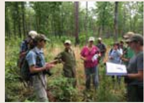
A long-held goal, NAA began on-the-ground Regional Workshops this year, a new initiative that delivers region-specific best practices in land management to our members and partners where they work.

“ NAA and the Natural Areas Conference focus on management, and the information is oriented toward implementation. NAA embraces scholarship and on-the-ground experience to develop the tools land managers need. ”